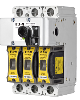
200 amp CCP Shown with through-the-front rotary